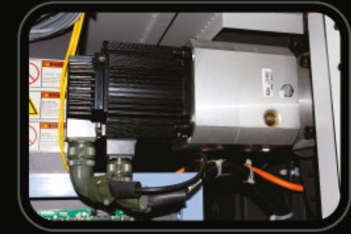
Servo Motor For Print Head Carriage and feeding System