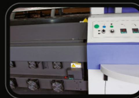
Multiple Drying System